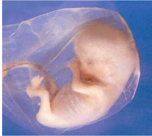
FETUS - LATIN FOR "YOUNG ONE" 8 WEEKS - 1 INCH TALL

"For You made my whole being, You formed me in my mother's body. I praise You because You made me in an amazing and wonderful way. What You have done is wonderful. You saw my bones being formed as I took shape in my mother's body. When I was put together there You saw my body as it was developing." Psalm 139:13-15 (International Children's Bible)