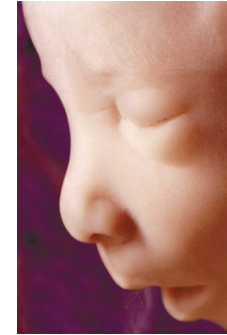
4 MONTH UNBORN CHILD 7 inches tall Picture is approximately life size

This genocide of the unwanted has become an everyday occurrence in our world. The sheer number of those being eliminated numbs our senses, but does not diminish the reality that these are human lives created by GOD.